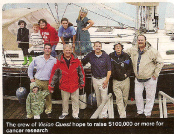
The crew of Vision Quest hope to raise $100,000 or more for cancer research